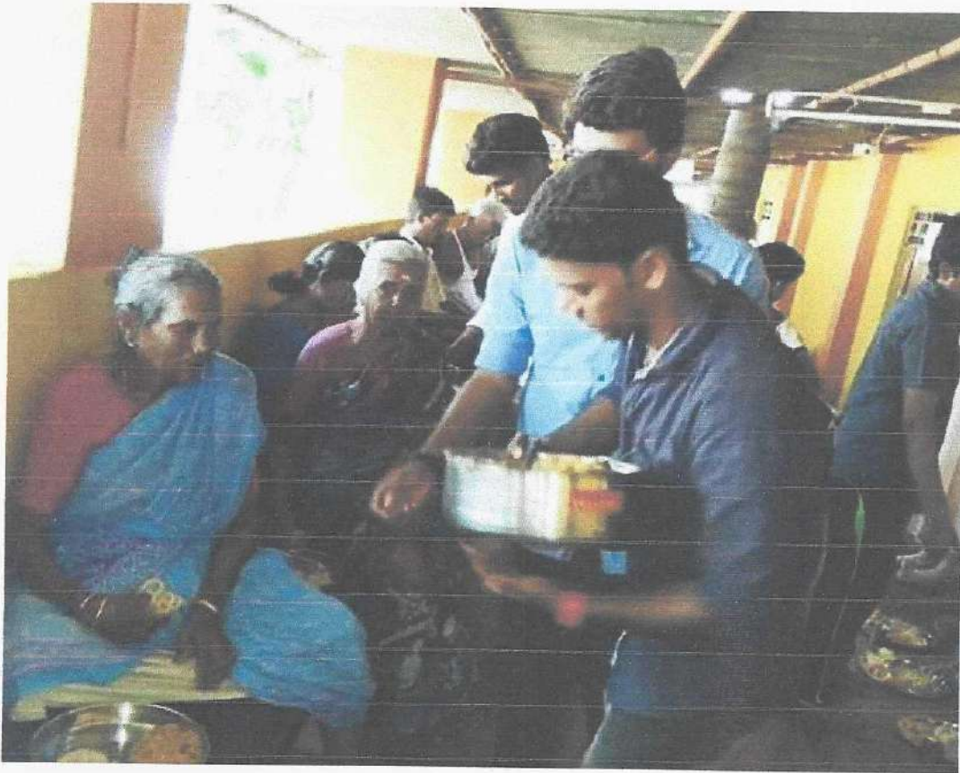
Orphanage Service at Periyanaiken palayam on 13.08.2019